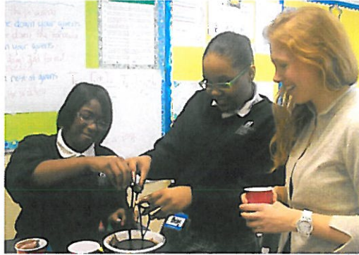
Undergraduate science education students from Georgetown University's Sparklab! visit WMSG at THEARC twice a month to conduct experiments. Here, students explore the results of certain chemical reactions.