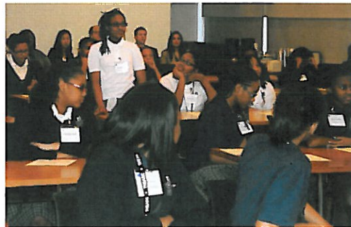
WMSG students question the attorneys, judges, and others present about their experiences in the legal field.

White & Case DC's Women's Network, along with the National Association of Women Judges, hosted a Color of Justice program for WMSG's 7th and 8th graders to help educate the students about different opportunities in the legal profession. The event featured input from judges, law clerks, law professors, attorneys, legal assistants, and others who shared their life experiences. The legal professionals who gathered, discussed the importance of developing a well-rounded skill set, including the mastering of reading, writing, and mathematics. Each one encouraged the girls to believe in themselves and work hard to achieve their goals.