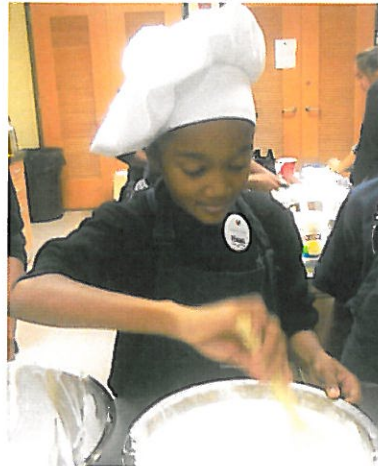
Eager 6th grader participates in Healthy Cooking Class

Each Thursday afternoon during the Extended Day Program, the sixth grade participates in a Healthy Cooking Class taught by Common Threads , who teaches children to prepare wholesome and affordable meals to help prevent childhood obesity, poor nutrition, and reverse the trend of generations of non-cookers. While cooking with ingredients from all over the globe, the girls are encouraged to celebrate cultural differences, as well as the things held in common by people all over the world.