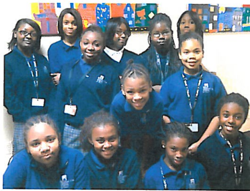
Winners of October 2010 Courage Award at THEARC Campus gather to wish our friends and supporters a happy holiday. Each month, students who exemplify the spirit of WMSG's founding spirits are selected by the faculty. These students are recognized for their persistence and determination towards becoming the best persons they can be.

Our Annual Appeal and Report will be on its way to you soon. As always, we deeply appreciate your involvement in the lives of our students.